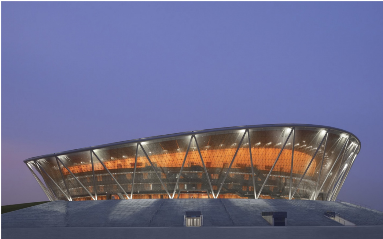
Fig. 1. Dongguan gymnasium, China.

Glass is for sure a fascinating material. It is used in many projects of our practice for a long time. The talk will give an inside on what was done (including some latest projects) and what are the subjects we want to think about in the future. Since this approach has to do with cooperation as well as interdisciplinary thinking some aspects of this general ideas will be shared. Synergies can be found in many aspects of what was developed during recent years. Some of these will be highlighted.