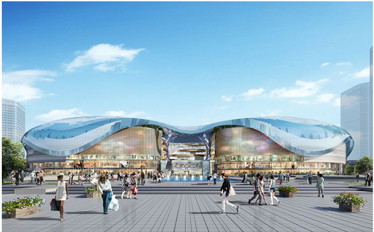
Fig. 3. Jinji Lake mall, Suzhou, China.